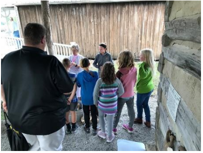
Good eats at the Chuck Wagon