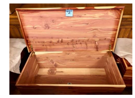
Cedar chest for sale in the General Store

In the next two pictures, members are picking corn with "new" equipment. Please see the last page for a larger picture of the cornhusking by hand with team and wagon.